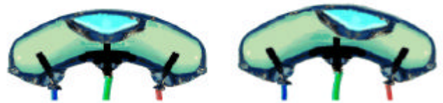
How an ELECTROLEVEL senses acceleration